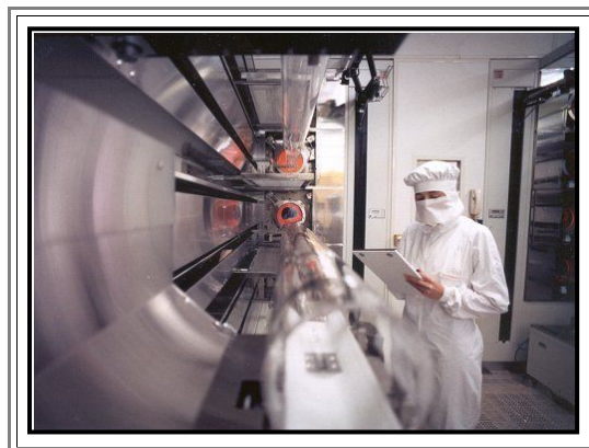
Looking along the mechanism for moving wafers into a furnace. The orange glow from the furnace tubes is visible.