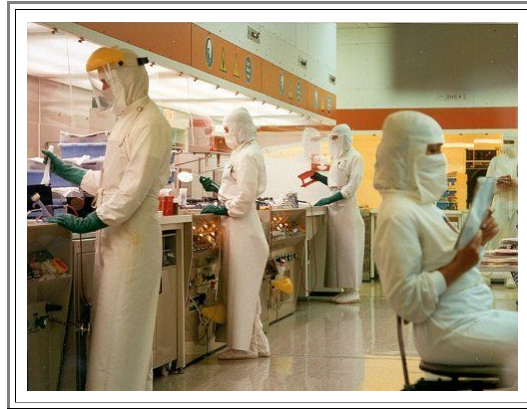
General view of work in a clean room