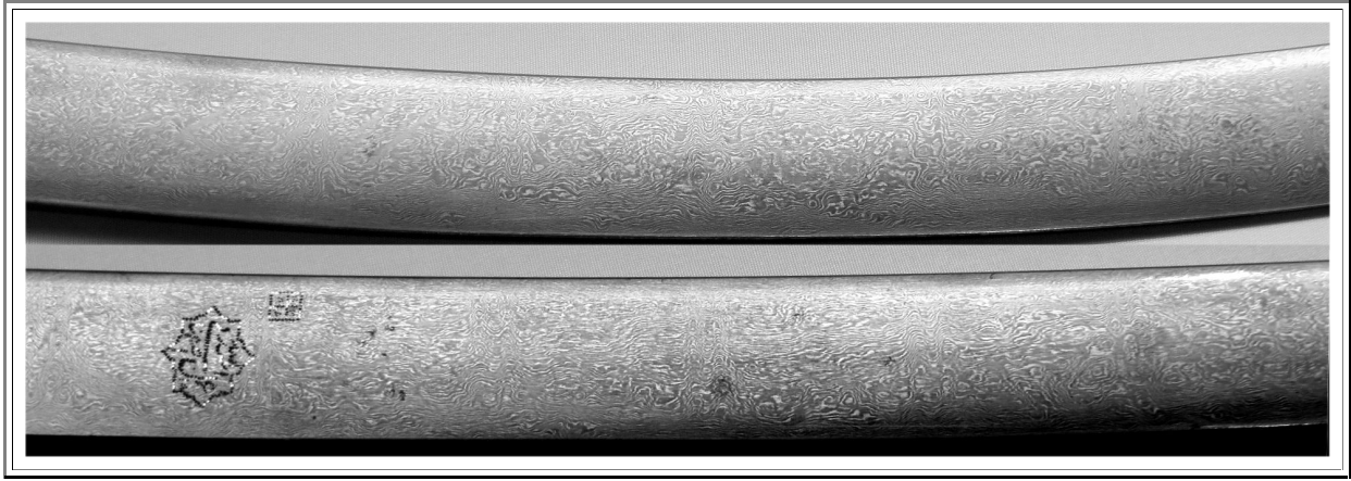
Link to text

Below is shown a "shamshir from the first half of the 19th century" that can be found in the Eremitage in St. Petersburg (far off the usual tourist stuff). It is badyl lit and one can only appreciate the double rung Kirk Nardeban pattern after processing photographs..