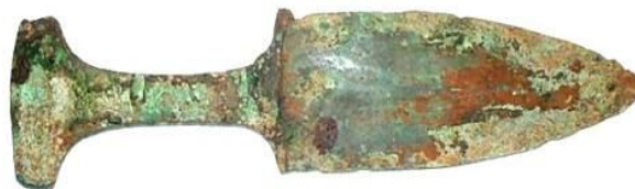
Flint dagger from Denmark, about 1800 BC Bronze dagger from South-East Asia, around 300 BC Different scales but comparable sizes; bronze dagger slightly foreshortened for match.