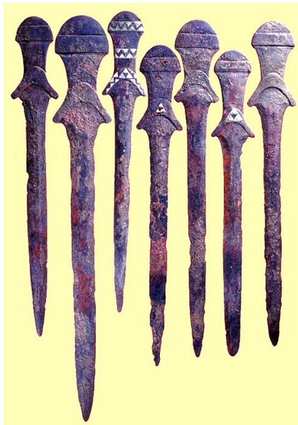
"Le prime spade al mondo" - the first swords of the world