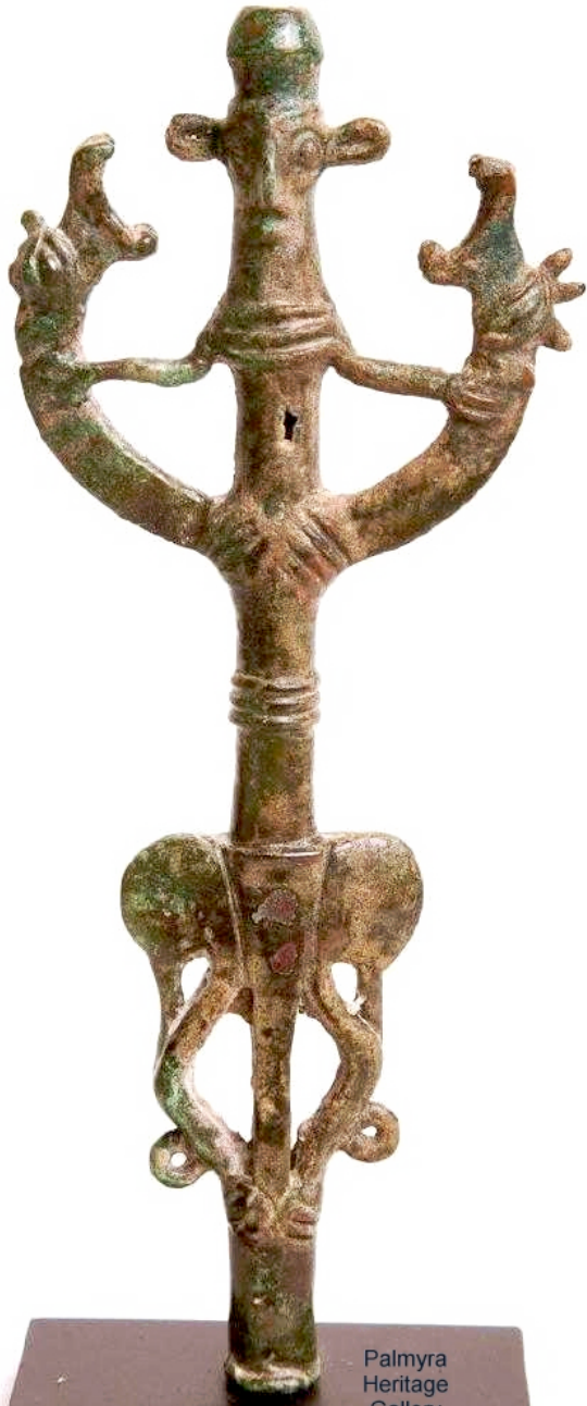
Palmyra Heritage Gallery