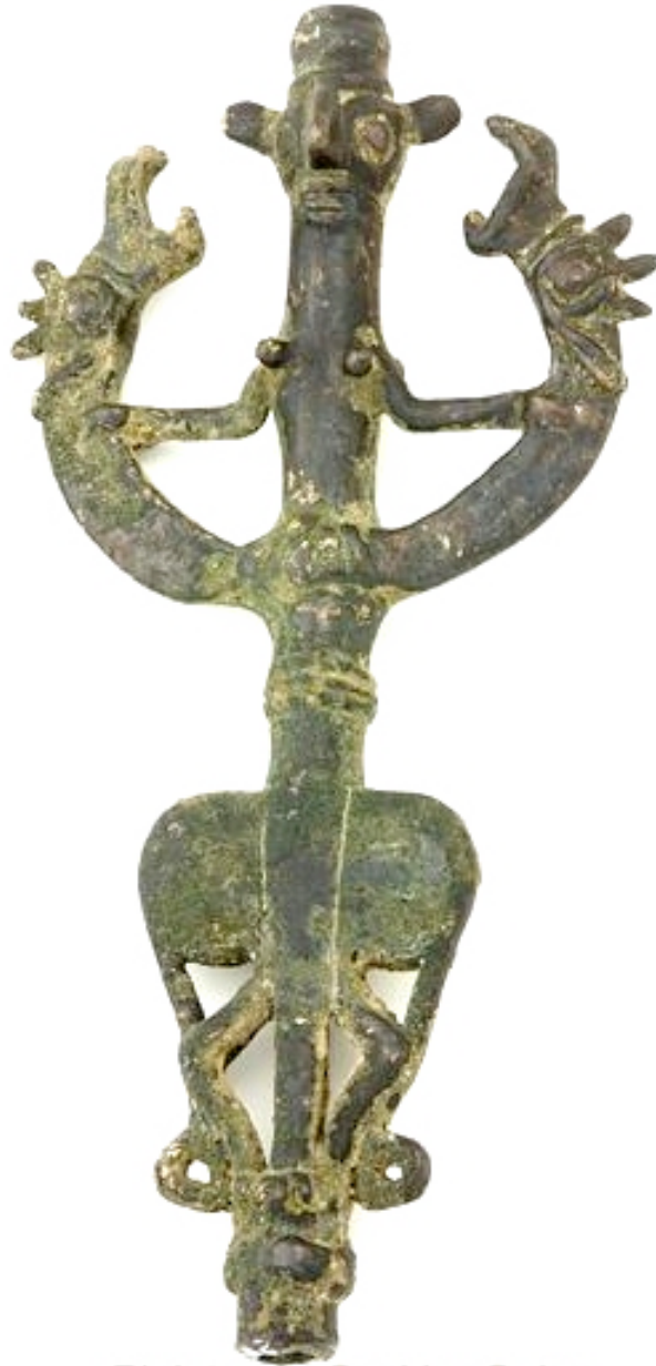
Pininterest Sackler Galery