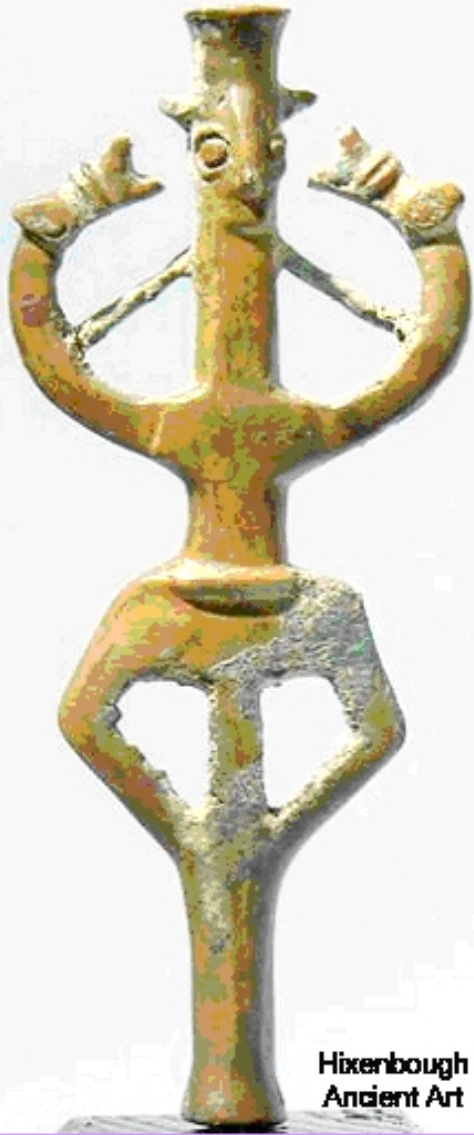
Hixenbough Ancient Art