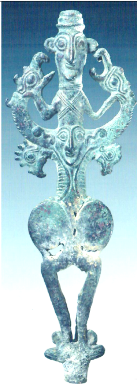
Archäologische Staatssammlung, München, 2002x