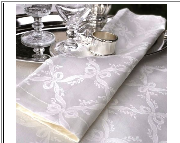
Damask table cloth and napkin

The damask weaving technique is rather tricky (it employs one warp yarn and one weft yarn, usually with the pattern in warp-faced satin weave and the ground in weft-faced or sateen weave; whatever that means). It makes no sense to feed an expensive technique with cheap materials and therefore expensive materials like silk are typically used for making damask.