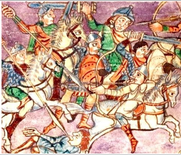
Swords with serpents in the blade; Stuttgart Psalter