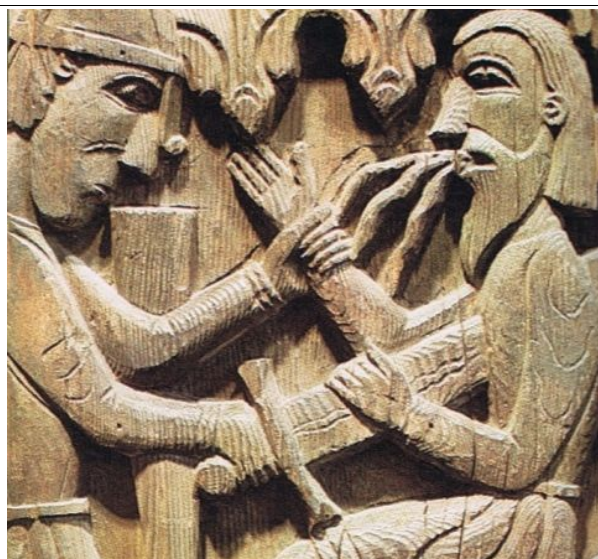
Sigurd / Siegfried kills Regin / Mime the Smith, his Forster Father . His sword ( Gram / Notung) shows a "serpent in the blade"

Here is a good "picture" to start with. The wood carving was part of a door of the Hylestad stave church in Setesdal, Norway; built in late 12th to early 13th century.