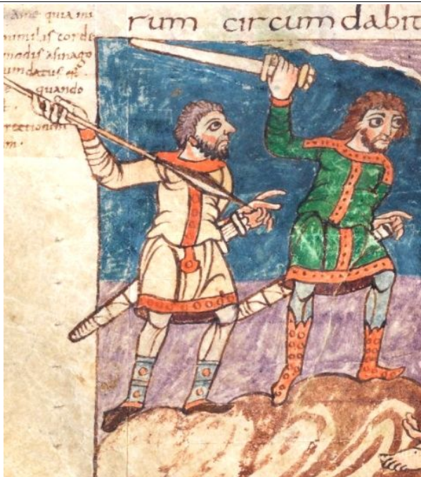
A swords with no serpent in the blade; Stuttgart Psalter