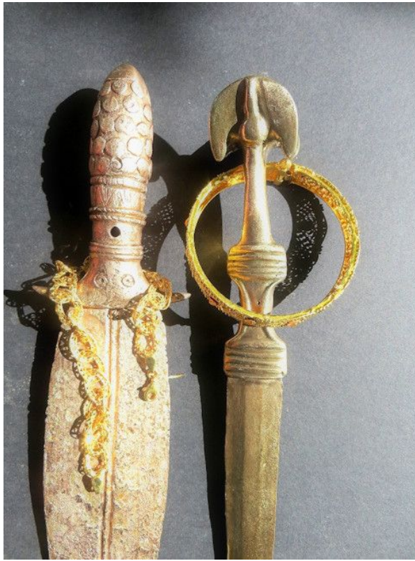
Comparison of "gold-like" bronze to real gold. Picture taken in direct sun light