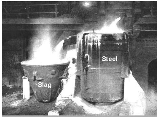
Tapping a Siemens-Martin furnace