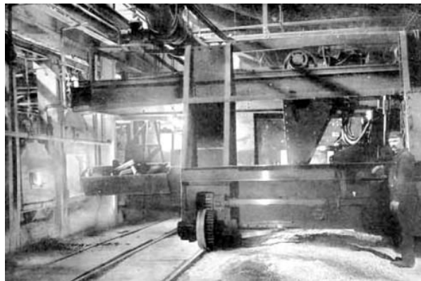
Charging a Siemens-Martin furnace