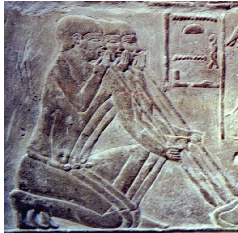
Supplying air with blowpipes

This was certainly done in antiquity, here is the proof. The picture is from the tomb of Mereruka in Saqqara, Egypt and dates to the 6th dynasty, 2 450 BC - 2 350 BC; Use this link to see the full picture.