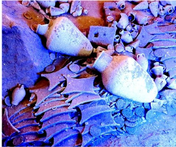
What the divers saw

● That's what a small part of it looked like to the divers (after some cleaning?):