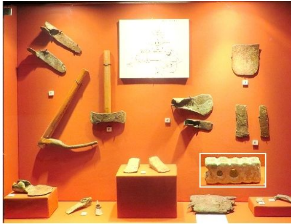
Some tools. The inset shows a die for wire drawing that is contained in an other case.