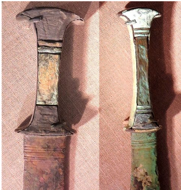
The hilts of two daggers, showing how it was "filled" with wood (?) and other stuff.

Finally, a close-up of two daggers that shows the hilt construction. This is rather unusual since the typically organic matter used has long since decayed.