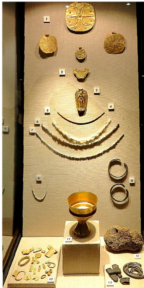
Show case with jewelry, gold and other precious stuff. Some obviously from Egypt.

Source: Photographed May 2017 in the Bodrum museum