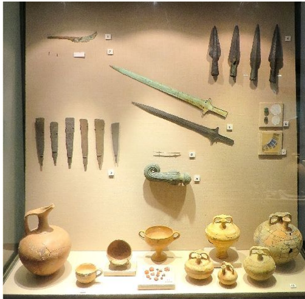
Show case with pottery, weapons and some special artifacts