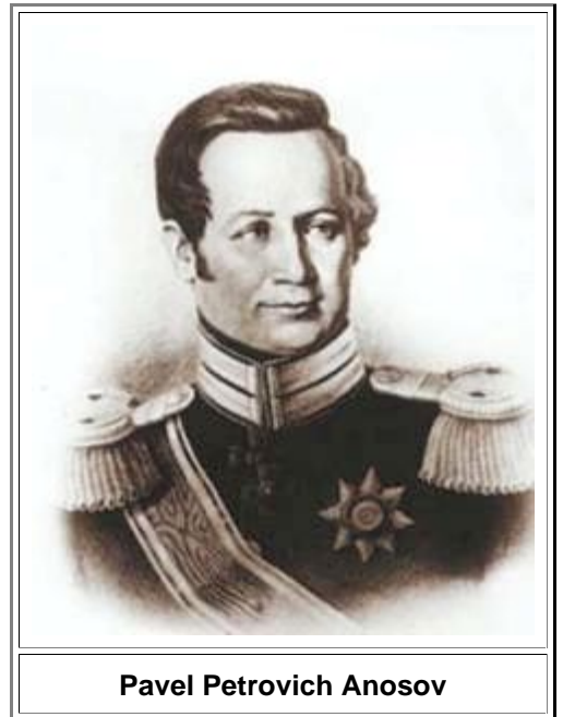
Pavel Petrovich Anosov

What he did not do is to find the secret of wootz / damascus steel because there never was a secret beyond the general secret of steel at this time. He did, however, find four ways to produce crucible Damascus steel with the characteristic pattern: