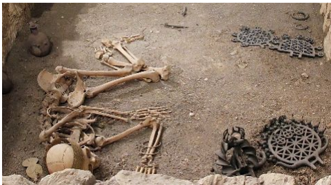
Parts of Royal Tomb with metal "standarts"

Even more recently (2018) he wrote a detailed paper about the graves. you can find it here . Here is a reconstruction of such a grave as seen in the (local) museum in Çorum.