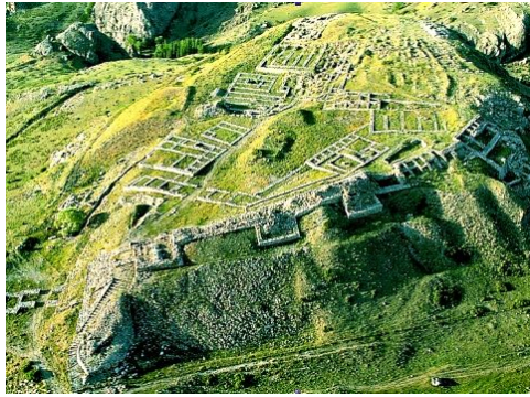
Alaca Höyük today

Alaca Höyük or Alaca Tell (Höyük means tell or hill) was an important city in pre-Hittite times, like Kültepe . It actually was "the" city of the flourishing Hattian culture during the Early Bronze Age. Starting around 1800 BC the Hittites eventually took over. They peaked around 1400 BC under Suppiluliuma I and Alaca Höyük lost importance as the near-by Hittite capital Hattusa of the Hittite empire rose to prominence. The more showy remains in Alaca Höyük, for example the "Sphinx Gate", are from the Hittite time. Alaca's claim to fame, however, comes from royal tombs where Hattian kings were buried. These graves yielded a wealth of metal objects, including the famous "iron dagger" of Alaca Höyük.