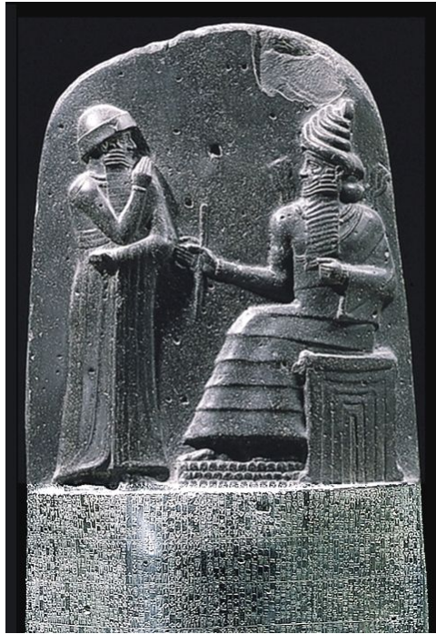
Hammurabi stele with (parts of) his code