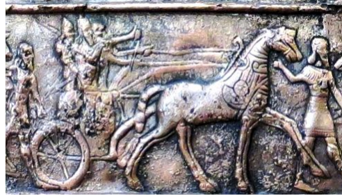
One of the feared "Chariots of Iron" Part of door plating from the time of Shalmaneser III, King of Assyria (859 BC - 824 BC)

The last one is of fleeting interest. The LORD looses against chariots of iron?