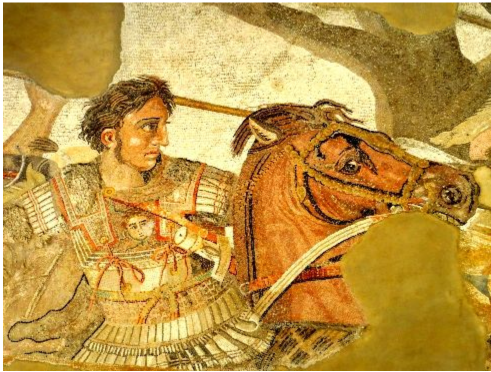
Alexander, with Bucephalus and a sword, fighting the Persian King Darius III. About the only old picture of him.