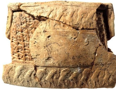
Letter from Kültepe in partially destroyed envelope

Source: Turkish Airline Journal; Thanks for sharing.