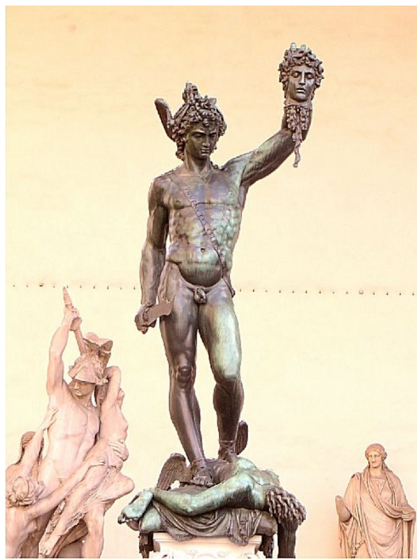
Benvenuto Cellini; Perseus with the Head of Medusa; ca. 1550; Loggia dei Lanzi

There is, however, a lot of art dedicated to the use of swords. The most famous one is this: