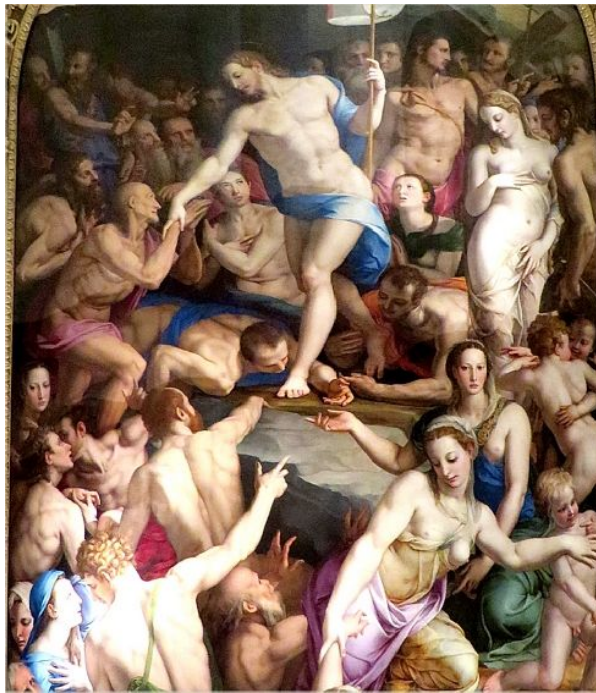
Bronzini: "The descend of Christ into limbo"; 1552.

▀ It goes without saying that there are plenty of dead Christians too in all those museums. In Santa Croce, you don't just find the tomb of Galileo but a masterpiece of Bronzini that merges the two genres: