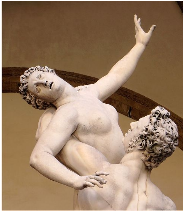
Giambologna; The Rape of the Sabine Women (1574–82), Loggia dei Lanzi

Source: Photographed in Florence March 2018