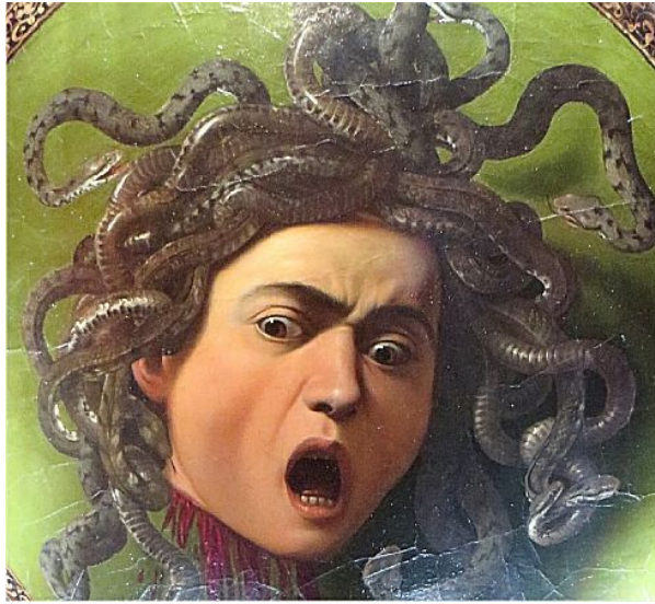
Annibale Carracci; Medusa, 1587; Uffizi

Source: Photographed in Florence March 2018