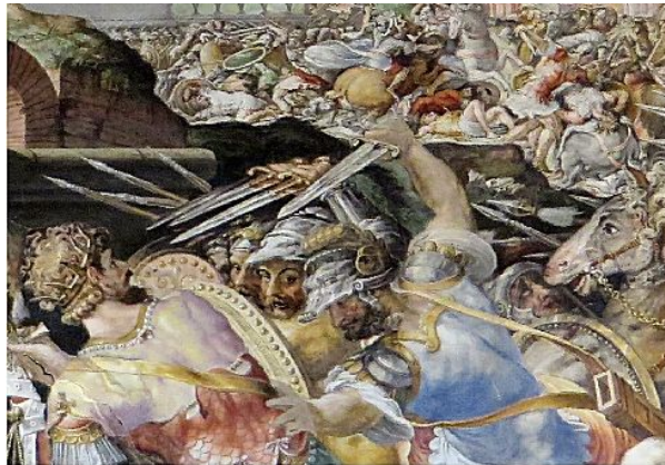
Florence is winning

Small part of monstrous painting in the Palazzo Vecchio, probably showing how Florence clobbered Siena