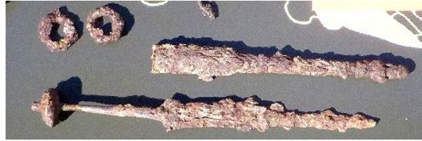
Rusty iron in Florence Museums; about all of it (Archeological Museum)

Source: Photographed in Florence March 2018