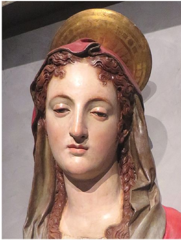
Maria Magdalena. Donatello; 15th century, Duomo Museum This lady is more than 500 years old and like new! Worth a sin or two.

Source: Photographed in Florence March 2018