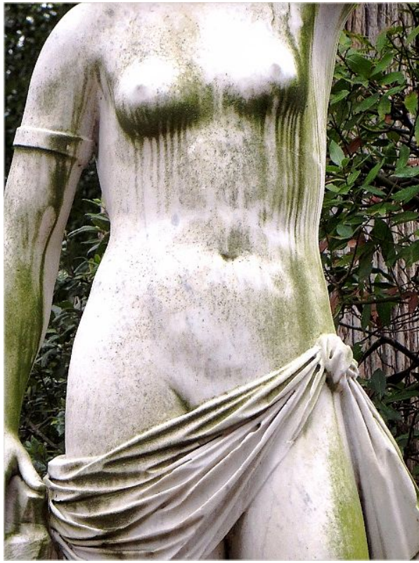
Boobs induced pattern formation with respect to the growth of algae. Boboli Garden