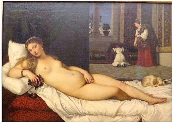
Venus; Tizian, 1538 (Uffizi)

▀ I know I kept you waiting - so here are the naked women: