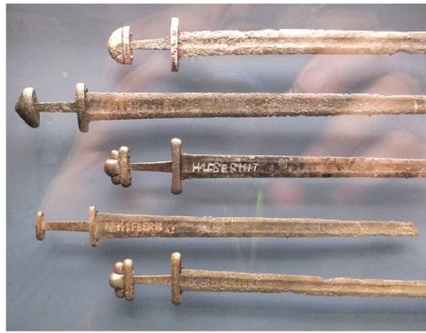
Ulfberht swords in the exhibition