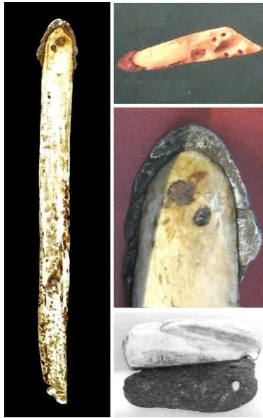
Inuit meteorite iron things: A harpoon (with detail) and two knives