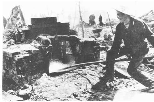
Puddling steel around 1958 "Operation of a traditional type of fining hearth in Shanxi"