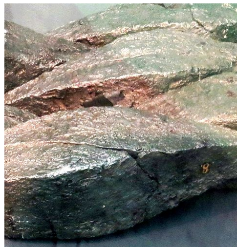
Celtic "trade" iron from Pleidelsheim, Germany