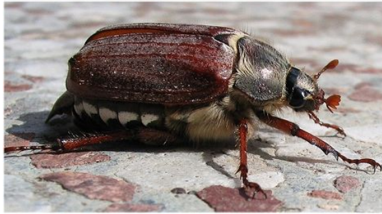
Cockchafer grub (Engerling) and what it turns into: May beetle (Maikaefer).

● Those things are big! And juicy. They used to be around by the billions, like crickets in biblical plagues, and constituted a big part of country life and lore in Europe. I have encountered huge swarms of the bugs when I was a kid. There are plenty of recipes for May-beetle soup in old cook books. It's supposed to be good.