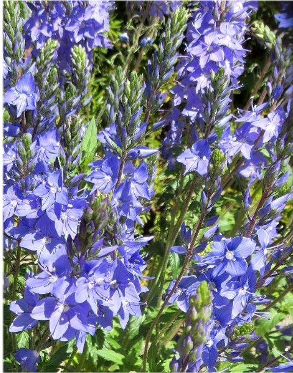
Vervain, Verbena, Verbenen, Eisenkraut Probably a cultivated version; the Internet provides for many somewhat different kinds.