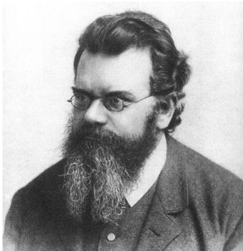
Ludwig Boltzmann (1844 – 1906)