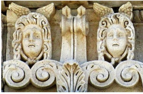
Pergamon and people in Pergamon today, quite bored after 2.000 years.