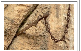
Roland's alleged Durendal "in the stone".

All things considered, there aren't all that many swords in stones around. Neither in reality nor in mythology. Even if we widen the topic to just "stuck swords", allowing the sword to be stuck in stones, anvils, trees or whatever, there isn't much around.